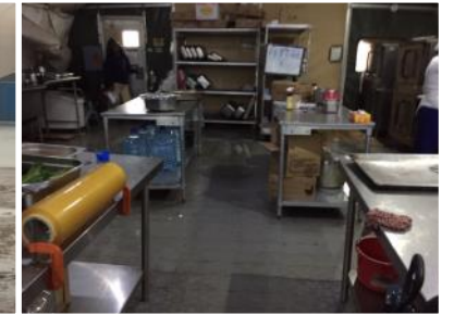
THERESA'S WORKPLACE GOT A BIT WET TOO