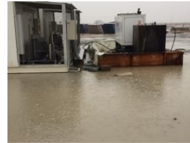
A WET DAY IN THE DESERT