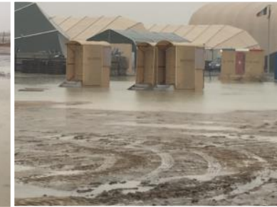
WHAT FUN! WADING TO THE PORTA-POTTY